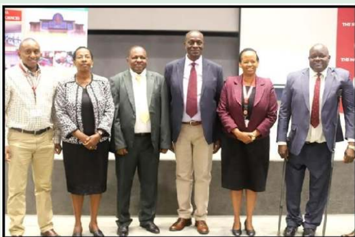
Group photo between KISE officials and The Nairobi Hospital Officials during the MoU signing at The Nairobi Hospital Hall.